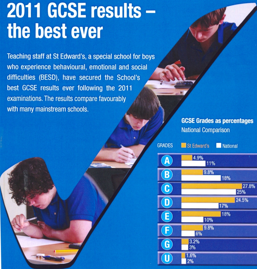
GCSE Grades as percentages National Comparison

Teaching staff at St Edward's, a special school for boys who experience behavioural, emotional and social difficulties (BESD), have secured the School's best GCSE results ever following the 2011 examinations. The results compare favourably with many mainstream schools.