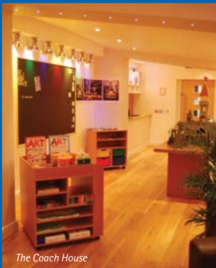
The Coach House

I am pleased to confirm the opening of a brand new facility, the Coach House, for use by our Additional Services team. Many boys are managing their anger and other difficulties more effectively through the specialist support they receive from the team. Our own maintenance staff, supported by many extremely generous donations from contractors and other benefactors, pulled out all the stops to complete a fine project and the Coach House is now a reality. We are most grateful for the support we have received to complete this important project to such a high standard.